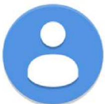
Zen Team Member